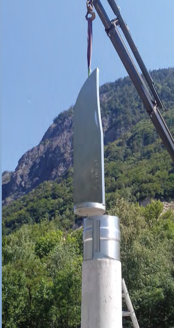
3: Placing the ferrule and the blade