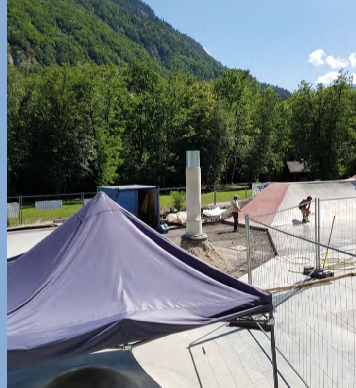
1: Placing the handle.