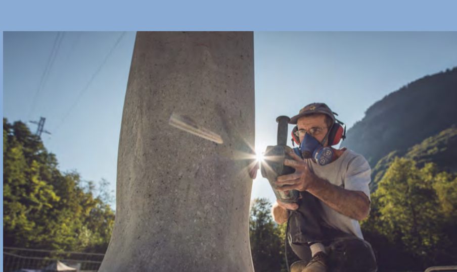
4: Shaping for the handle by Fabrice Dompnier