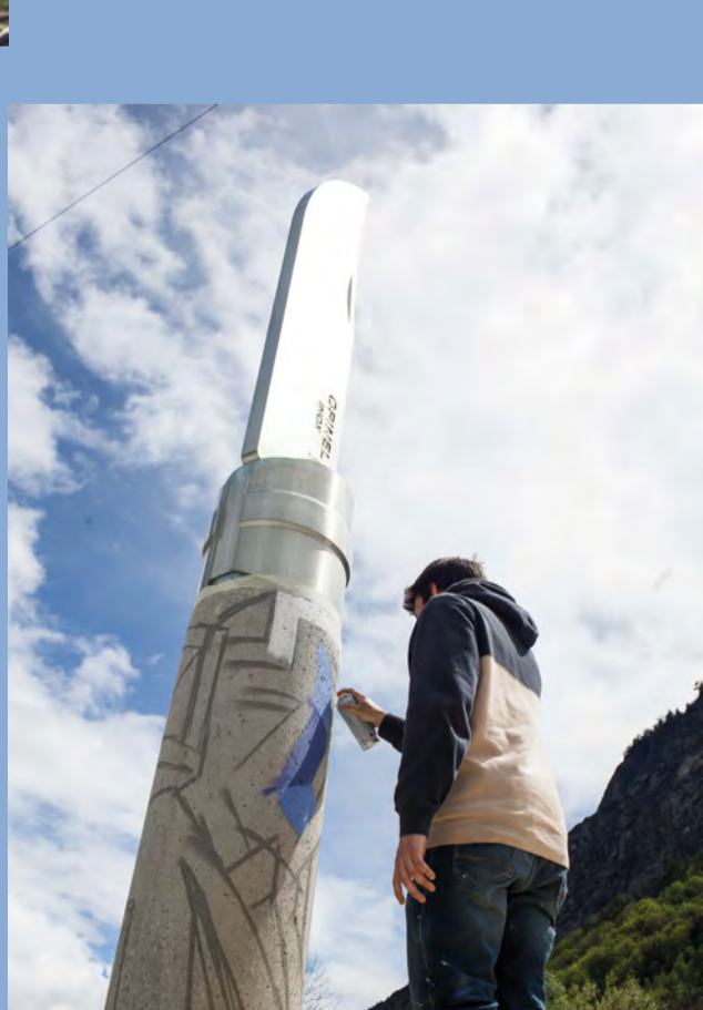
5: The artist Chufy colors the handle