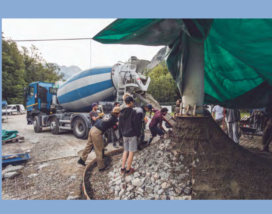
2: Pouring the cement